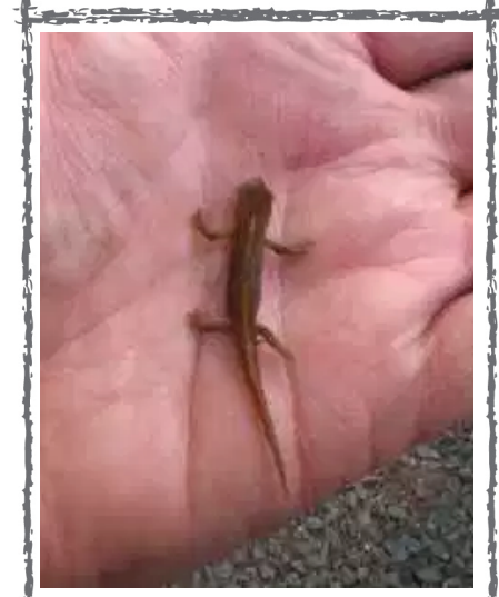
Smooth newt eft