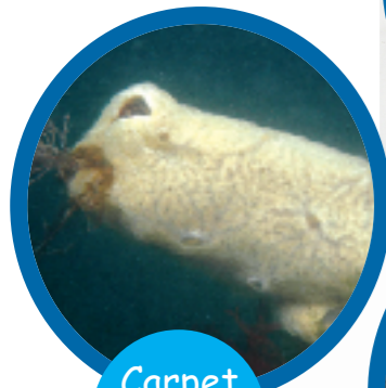
Carpet Sea Squirt